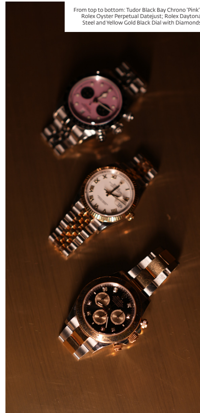
From top to bottom: Tudor Black Bay Chrono 'Pink'; Rolex Oyster Perpetual Datejust; Rolex Daytona Steel and Yellow Gold Black Dial with Diamonds