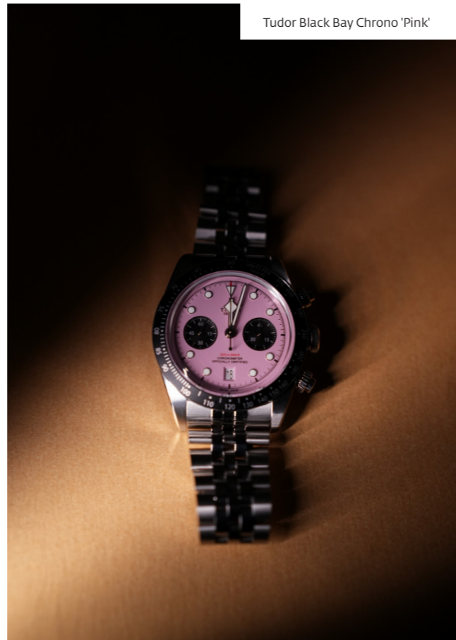
Tudor Black Bay Chrono 'Pink'

Very impulsive. You're just drawn into this little cocoon. But when it comes to the actual purchase, you need to understand the intent. Is it for evening wear, official meetings, or just a morning walk? Once the intent is there, it becomes a very deliberate conversation. You look at the history and the legacy. If you're an understated luxury person, you go for heritage, if you're a tech freak, you go for complications. The start is always instinctive, but the end is always structured and deliberate.