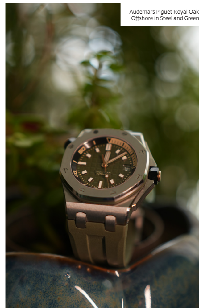
Audemars Piguet Royal Oak Offshore in Steel and Green