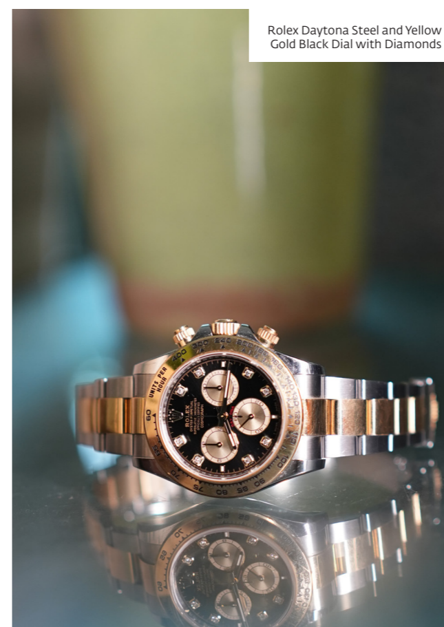
Rolex Daytona Steel and Yellow Gold Black Dial with Diamonds